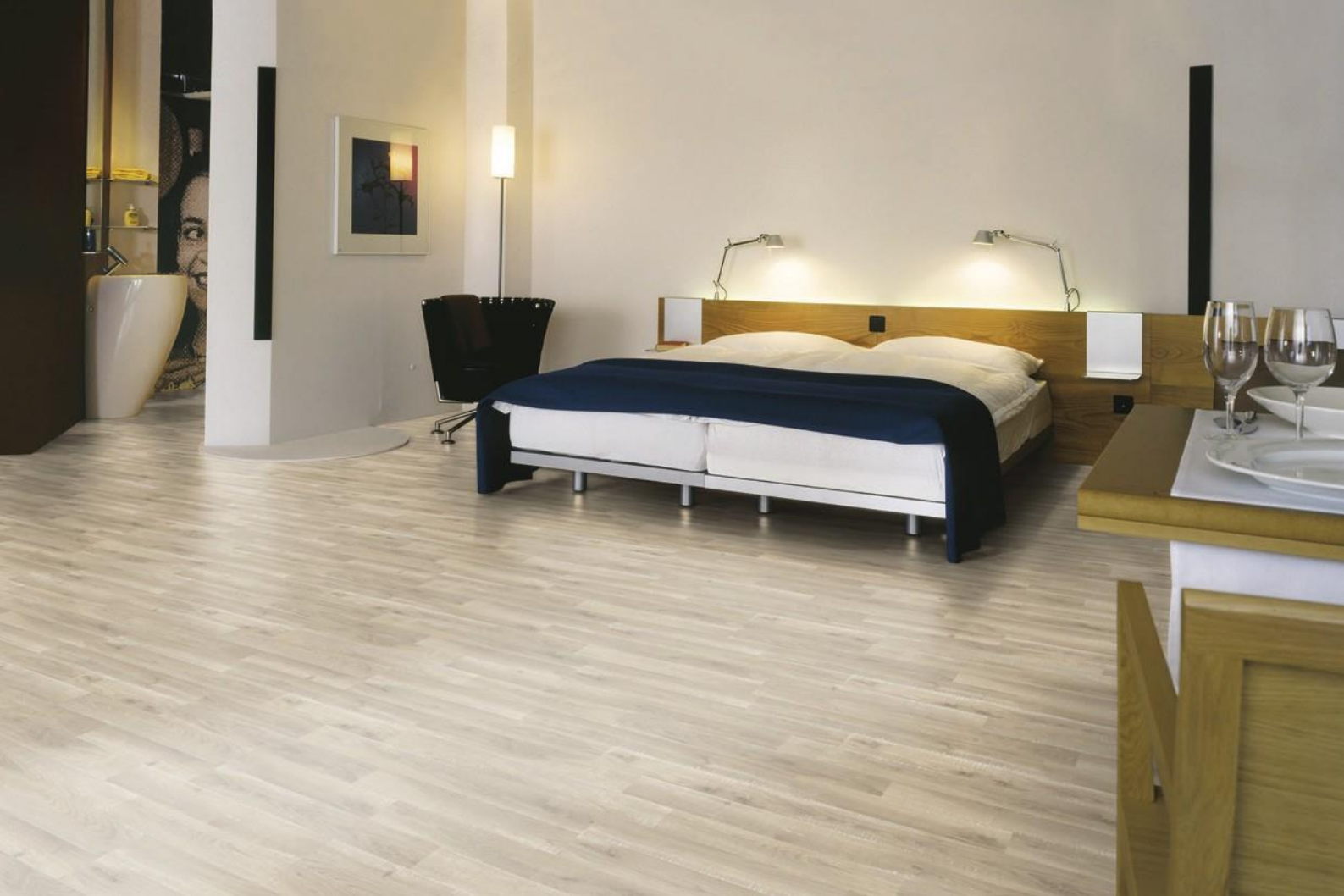
Cutter Oak - D2450