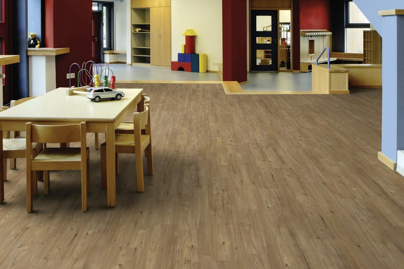
Kallisto – D4771