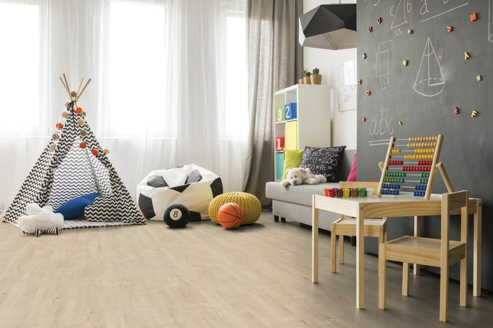
Maple - D4636