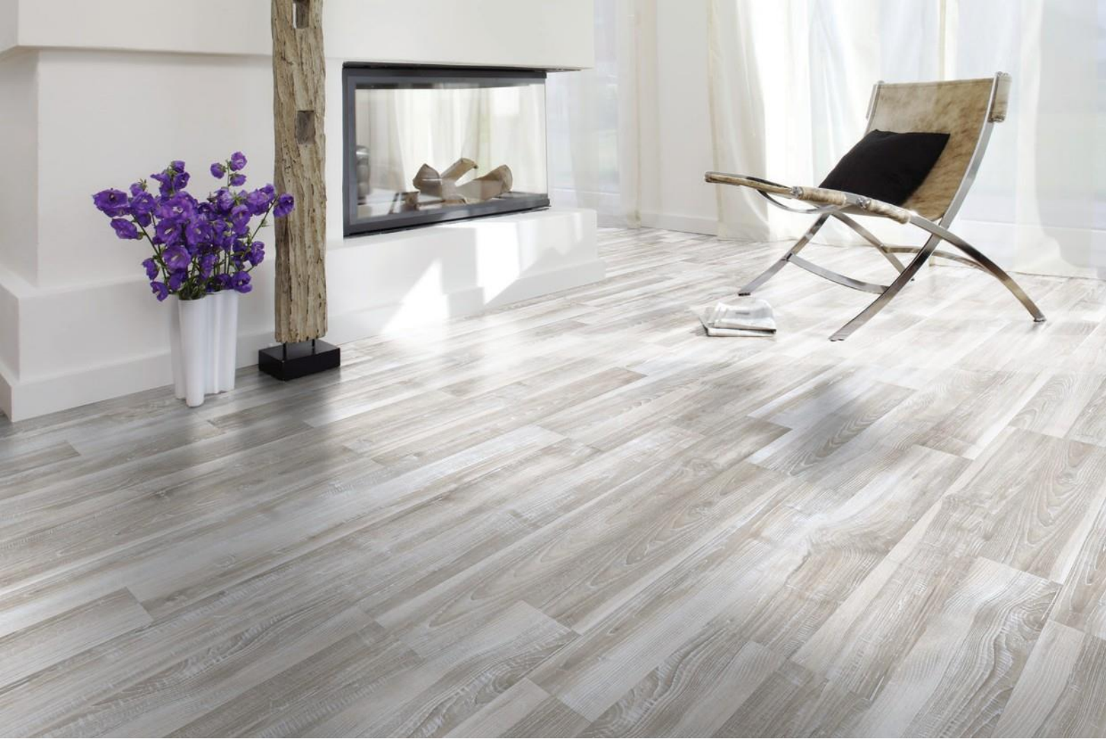
Stockholm Ash – D3007