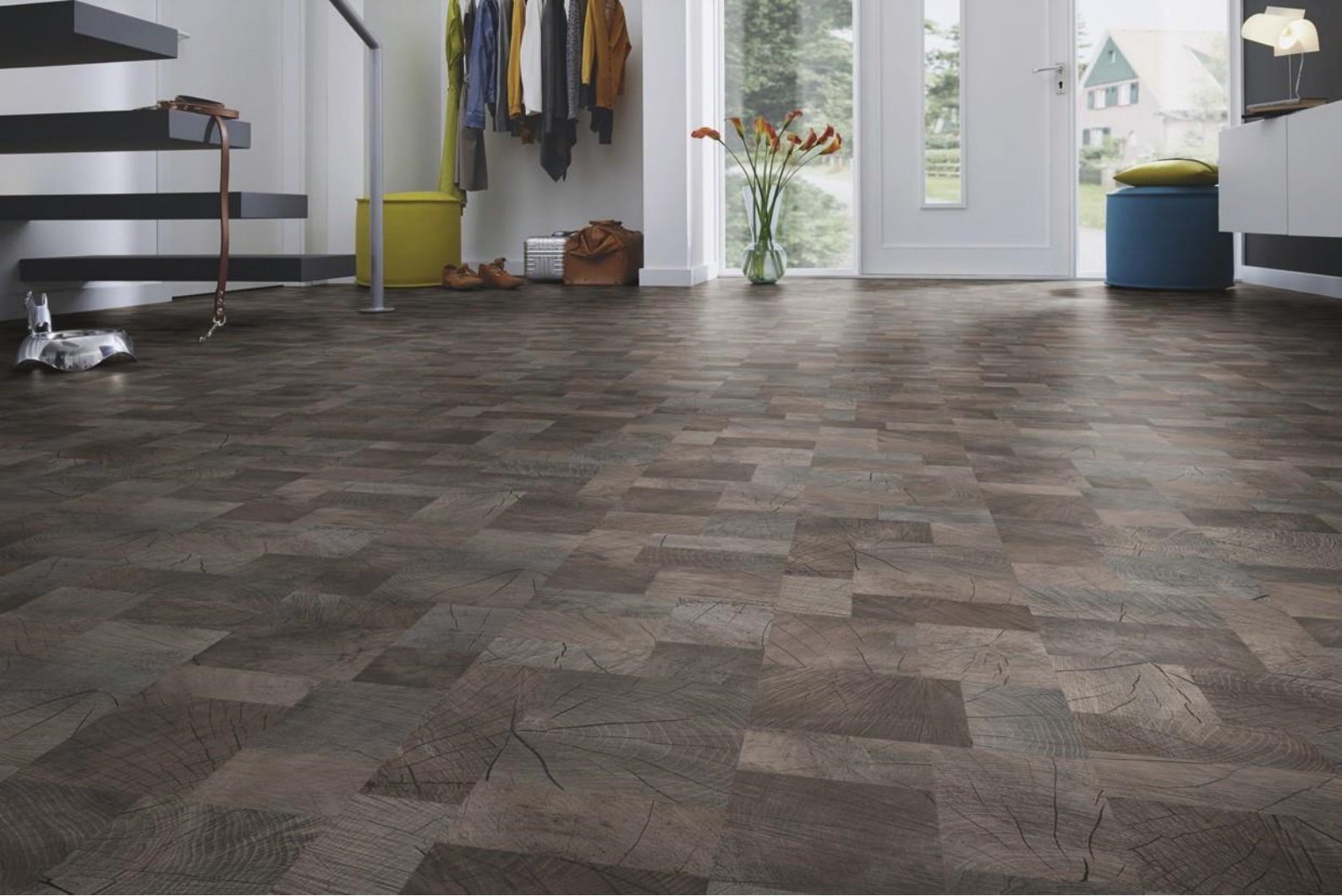
Block Wood – D3585