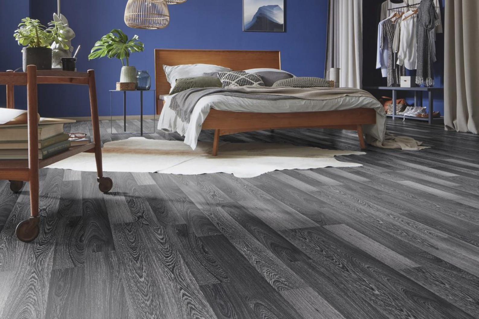
Black and White – D2955